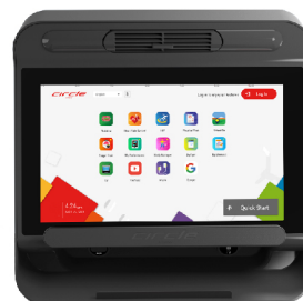
Entertainment Plus 2.0