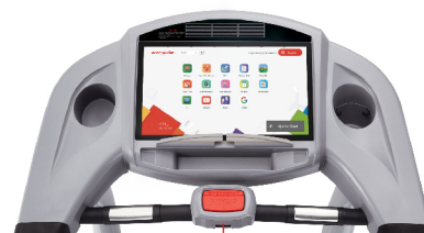
Entertainment Plus 2.0