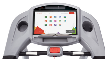
Entertainment Plus 2.0