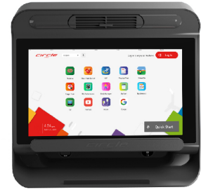
Entertainment Plus 2.0