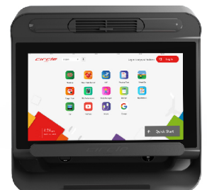
Entertainment Plus 2.0