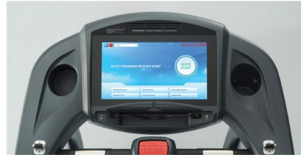
M7 Entertainment Plus 2.0