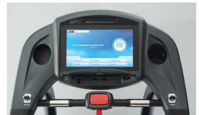
Entertainment Plus 2.0