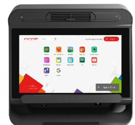
E Plus (New)