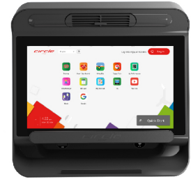
E Plus (New)