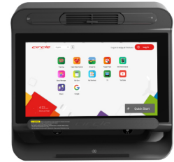
E Plus 2.0