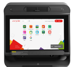
Entertainment Plus 2.0