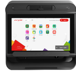
E Plus (New)