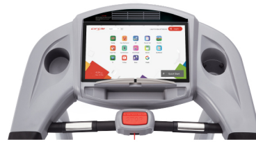
Entertainment Plus 2.0